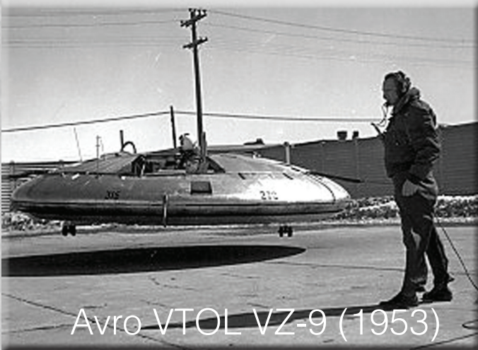
Avro VTOL VZ-9 (1953)